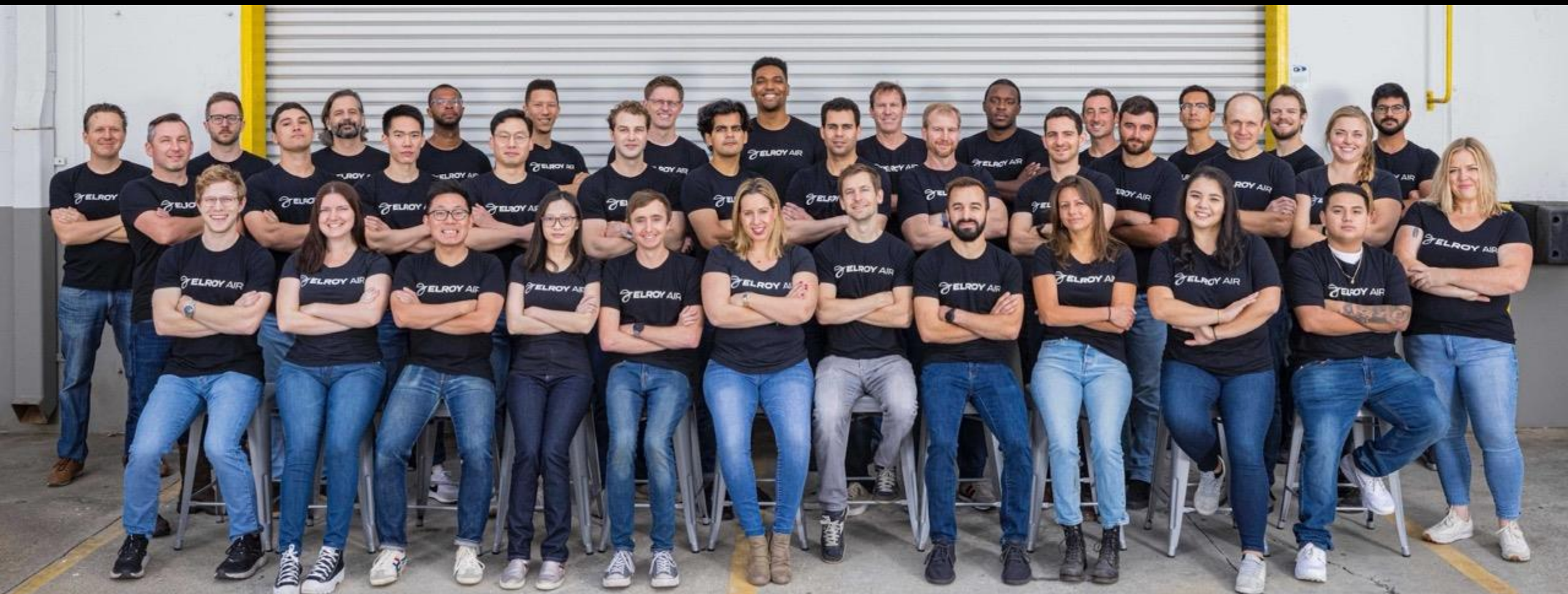
The Elroy Air team is a dedicated, diverse group of experts in autonomous systems and software architectures, aerospace, design, shipping logistics, and supply chain.